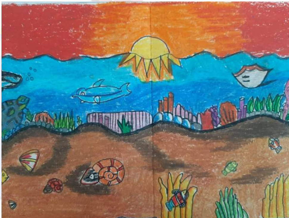
MITHRA MAHESH Grade - 3