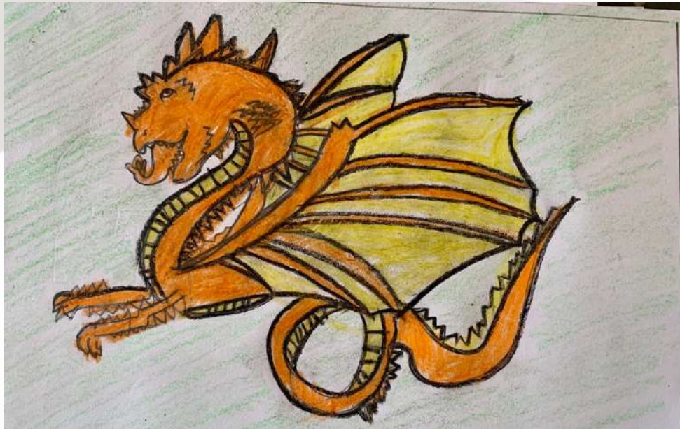
SHAMBAVI SHUKLA Grade - 2