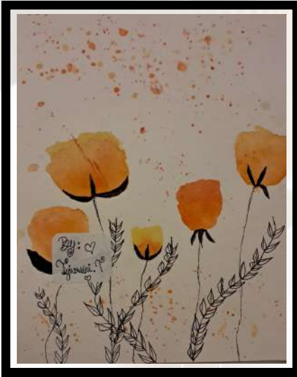
TEJASWINI - 6C