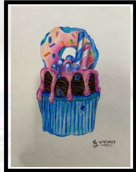
CHINMAYI SARAVANNAN - 8C