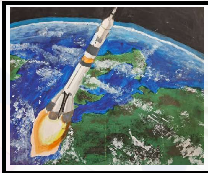
SRI ANUSHYA - 8B