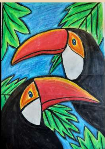
Master Syed Grade XB