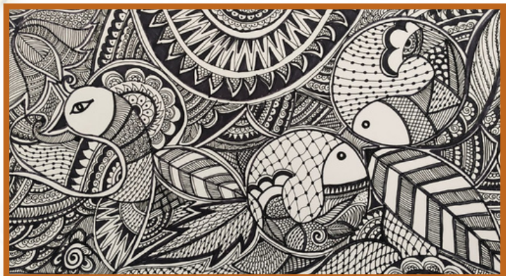
IMRAN HASIN GRADE VII