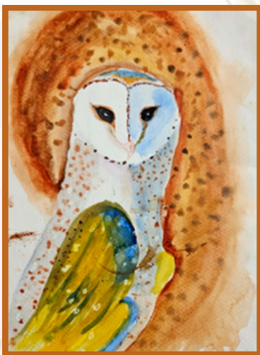
HABI KRITHIKA GRADE 5