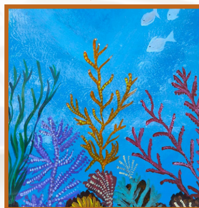
GAYATHRI B EDUCATOR