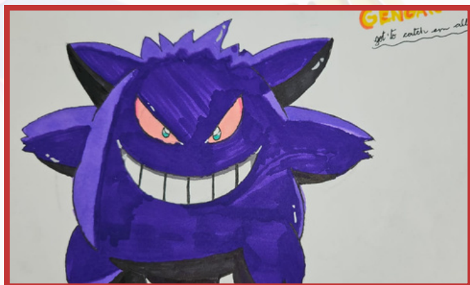
MUKUND MADHAVAN Grade 6