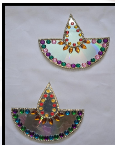
ANUJHA TAMIL EDUCATOR