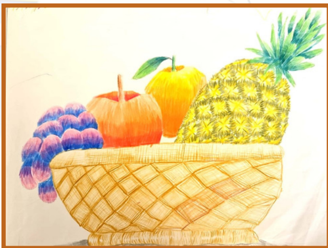
TIANA ATUR GRADE V