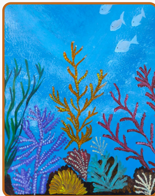
B GAYATHRI EDUCATOR